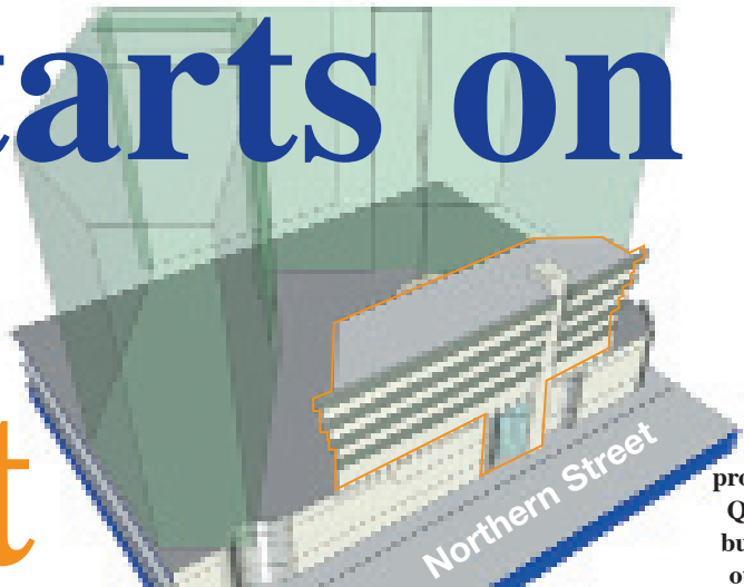
The housing project Hanson Quickfall is to build is picked out in orange.

Hanson Quickfall has begun work on a contract worth £1.8m to build a unique housing development on a prestige site close to Wellington Street in the heart of Leeds.