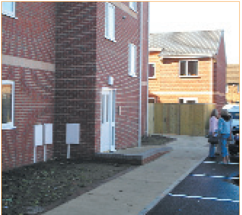
Tenants are already moving in to the Havelok Housing Association's development on Grimsby's Heneage Road, built by Hanson Quickfall.

Havelok became part of the Longhurst Group two years ago, looking to maintain its independence, but simultaneously drawing benefit from the financial strength and the broad knowledge and expertise available in the larger organisation.